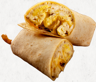
Egg & Potato Breakfast Burrito