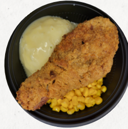
Drumstick Mashed Potato Bowl