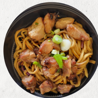
Chicken Chow Mein