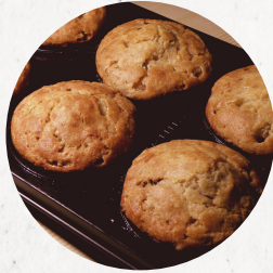
Banana Cinnamon Muffin