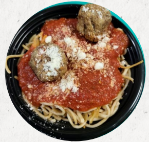
Spaghetti with Meatballs

All meals include California grown fruits and vegetables! Featured seasonal fruits this fall include plums and nectarines. Schools also have salad bars or veggie trays filled with leafy green salads and cut vegetables paired with our student favorite house-made ranch.