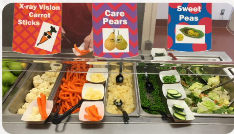
Elementary School Salad Bar

Freshly prepared meals are offered across all grade levels! We offer healthy meals made with whole grains, like teriyaki chicken, orange chicken, and Korean beef with brown rice. We also serve wheat pasta dishes like spaghetti with meat sauce and chicken alfredo.