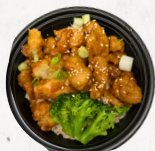
Orange Chicken Rice & Broccoli