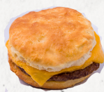
Sausage & Cheese Biscuit Sandwich

Scan the QR code or visit c-vusd.org and click on Nutrition Services to see what delicious and nutritious meals will be served each day.