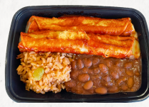
Cheese Enchiladas Rice & Beans